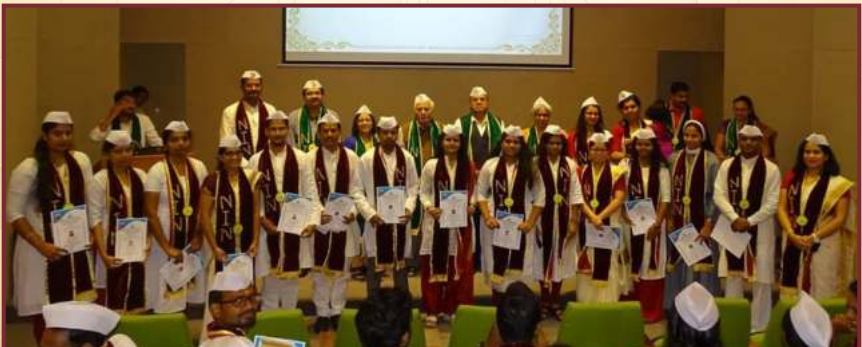
Fellowship students receiving certificates in award ceremony