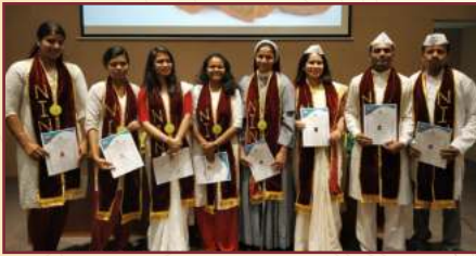
First batch Fellowship students